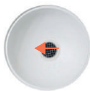
Built in carbon filter