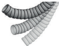
Easy adjustment of length