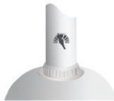
Wind volume controllable damper