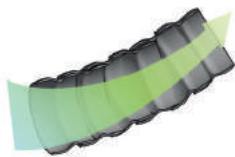
Designed to minimize air stagnation