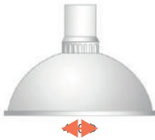
Better with 450Φ dome