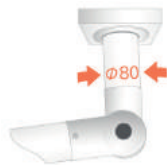
80Φ mm diameter