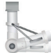
Quality gas spring