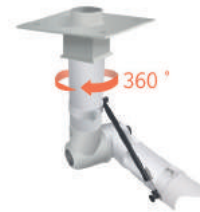
Easy handling by user with 360 degree rotation