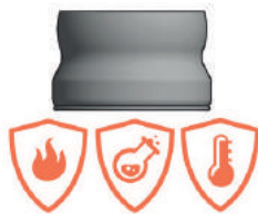
Resistant against chemical, heat, weather and abrasion