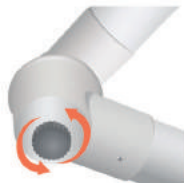
Easy disassembly, assembly and moving with the use of control bolt