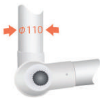
110Φ mm diameter