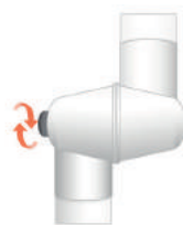
Easy disassembly, assembly and moving with the use of control bolt