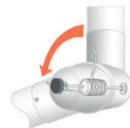
Quality high tension spring