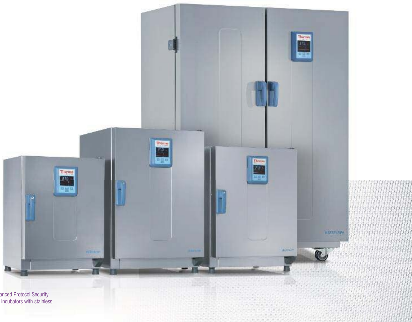
Heratherm Advanced Protocol Security microbiological incubators with stainless steel exterior

An optional stainless steel exterior is available for the Advanced Protocol and Advanced Protocol Security models.