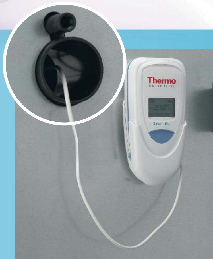
Rear view of the 100 L Advanced Protocol oven with Smart-Vue

Solutions vary by RF regions worldwide and are compatible with multiple brands and types of laboratory equipment. Contact your local sales representative for more details.