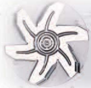
Two speed fan for matching the airflow to your application