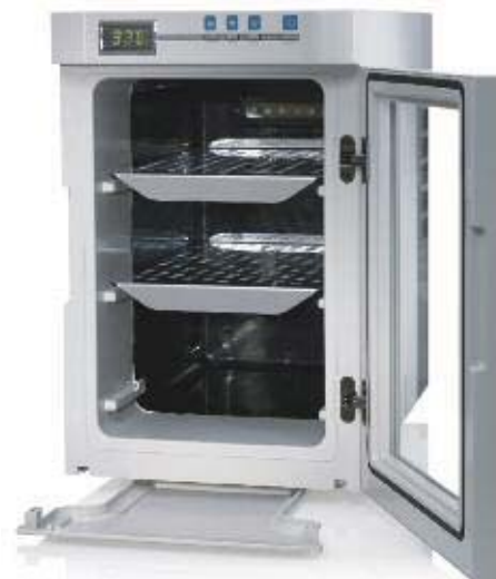
Heratherm Compact microbiological incubator, 18L