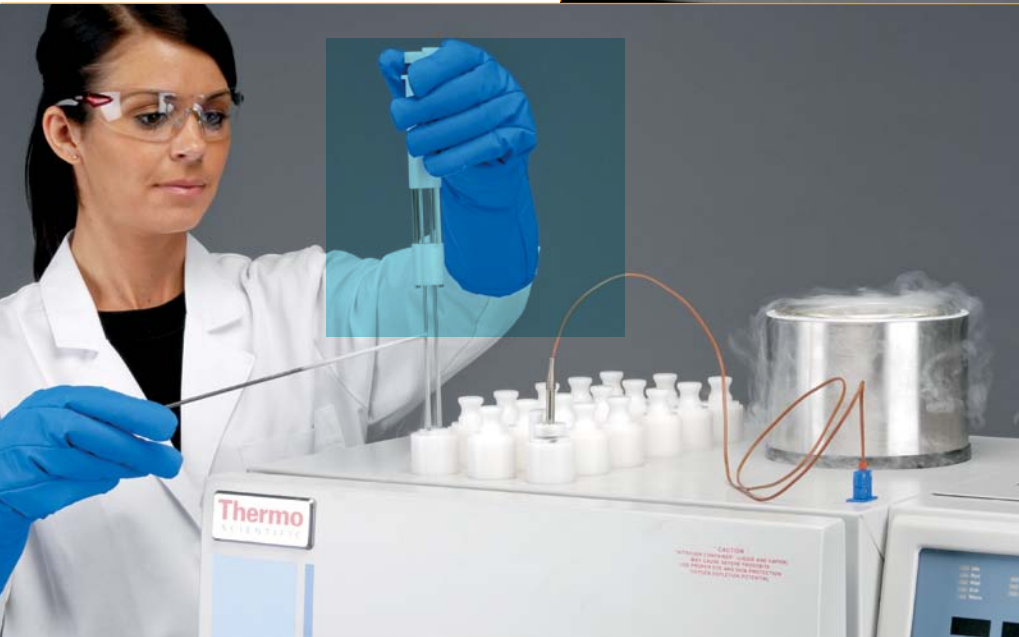
Top- and front-access models are designed for easy access for manual seeding