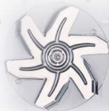
Fan adjustable in two speeds for matching the airflow to your application