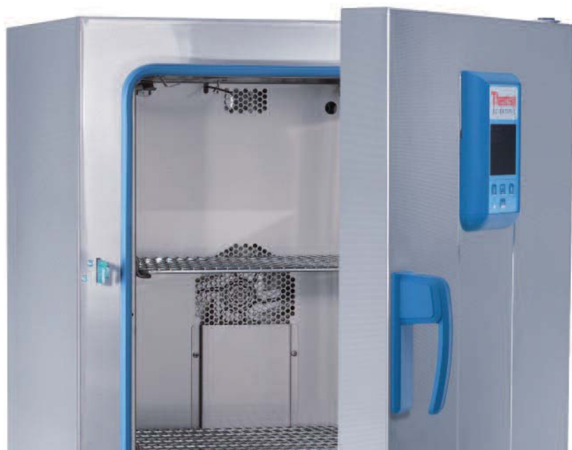
100 L model shown

As well as incorporating all the benefits of our General Protocol table top ovens, the Advanced Protocol range boasts additional features providing even more flexibility, accuracy and dependability.