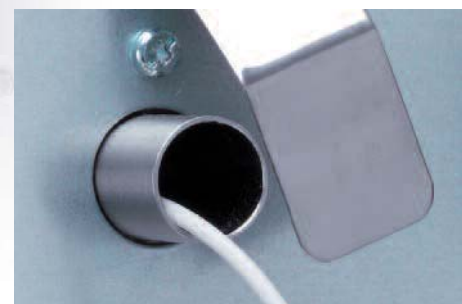
Dedicated access port (18 mm in diameter) allows the introduction of independent sensors