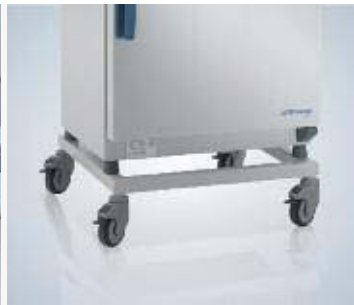
Support stand with casters