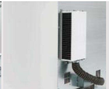
Fresh air particle Filter