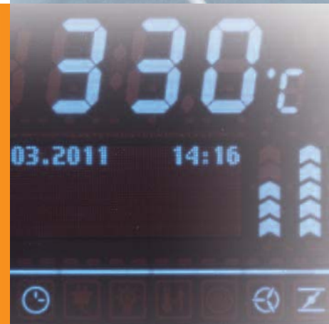
Operating temperatures as high as 330 °C