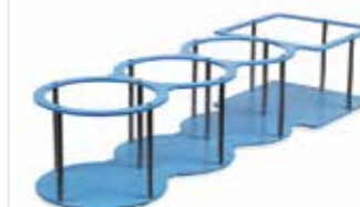
Bottle stand 1 x 4 configuration Wellwash Versa