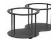
Bottle stand 1 x 2 configuration Wellwash