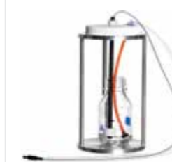
Bottle stand for user bottles