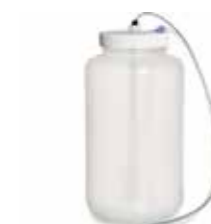
4 l wash bottle