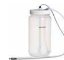
2 l wash bottle