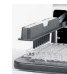
Wellwash with 1 x 8 wash head