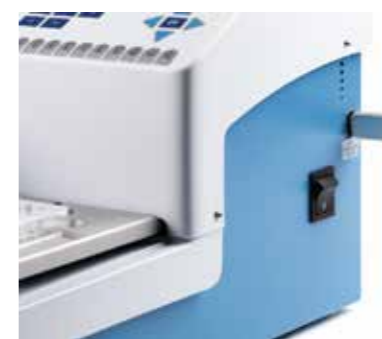
Wellwash Versa with a USB flash memory stick