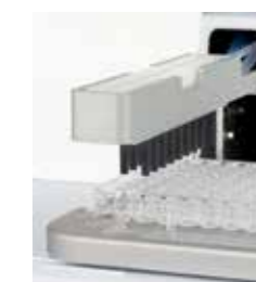
Wellwash Versa with two 1 x 8 wash heads