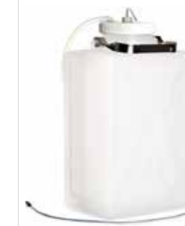
9 l waste bottle