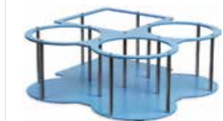
Bottle stand 2 x 2 configuration Wellwash Versa