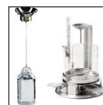
Liquid Density Kit