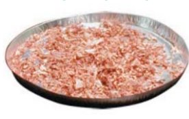
CDP 50 Set of 50 Pcs