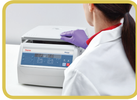
Fast one-click centrifuge lid closure