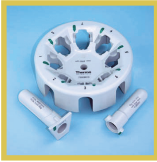
Unique DualSpin rotor with hybrid design