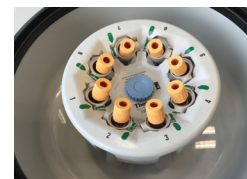
DualSpin rotor with swinging buckets