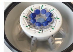
DualSpin rotor with fixed angle buckets