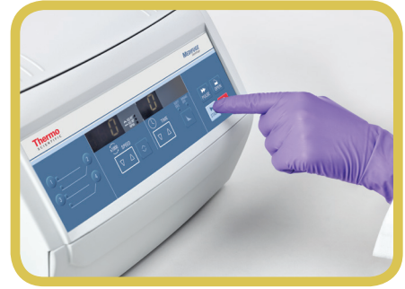
Large, brightly-lit display with intuitive controls